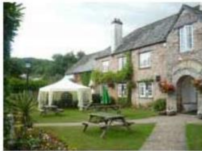
Court Farm Inn Abbotskerswell 01626 361866

Call Us Now: 01803 813 803 Email: info@southern-timber.co.uk