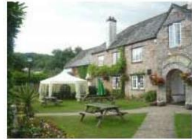
Court Farm Inn Abbotskerswell 01626 361866